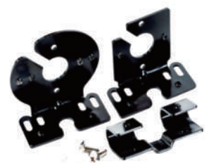
C Bracket L Bracket