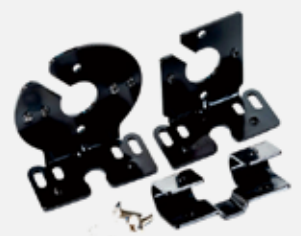
C Bracket L Bracket